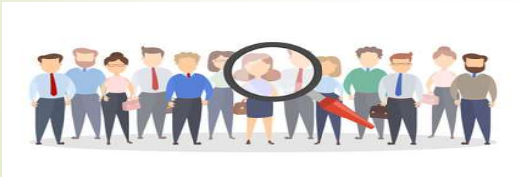
FLEXI STAFFING & PAY ROLL MANAGEMENT