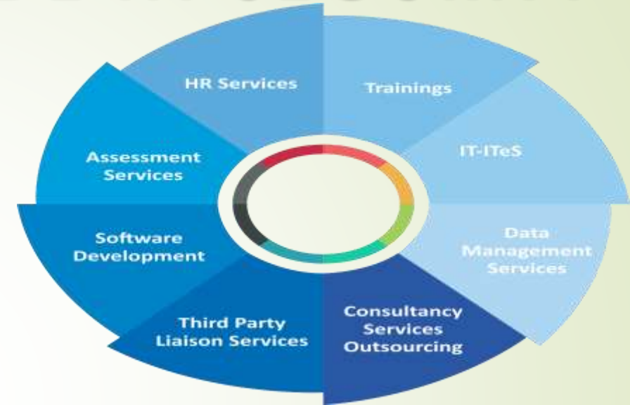
LIAISON WITH GOVERNMENT ORGANIZATIONS