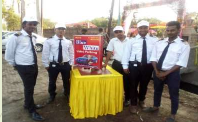
DRIVERS IN HOTEL FOR VALET PARKING.