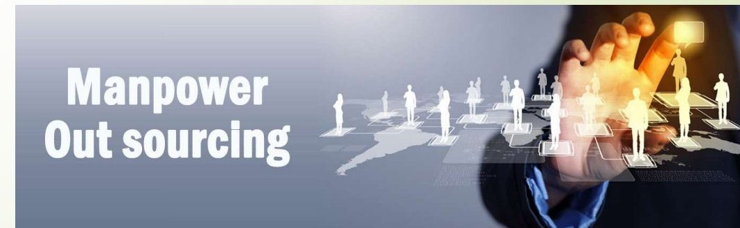
Manpower Out sourcing